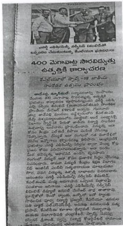
The News coverage about the event of Spark by Print media