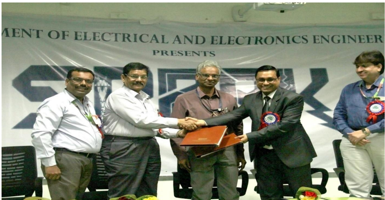
MOU exchange between KLEF and EESL

Department of EEE also has an MOU between KLEF and Energy Efficiency Services Limited.