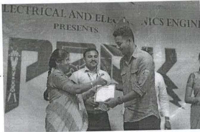
Certificate distribution at Valedictory to the participants.

All together 300 students participated in workshops, Technical and Non -Technical Events. Cash Prize was given to the winners in all technical and non-Technical events. Participation Certificate was given to all participants.